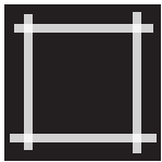
1. Polyshield Primer for EPDM or previously painted surfaces

Clean two areas of roof, each approximately 12 inches x 12 inches. In the middle of each area mask off two squares, each approximately 8 inches x 8 inches. Then use marker on the painter's tape to label each square as shown.