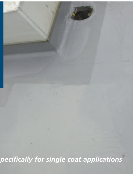
Developed specifically for single coat applications